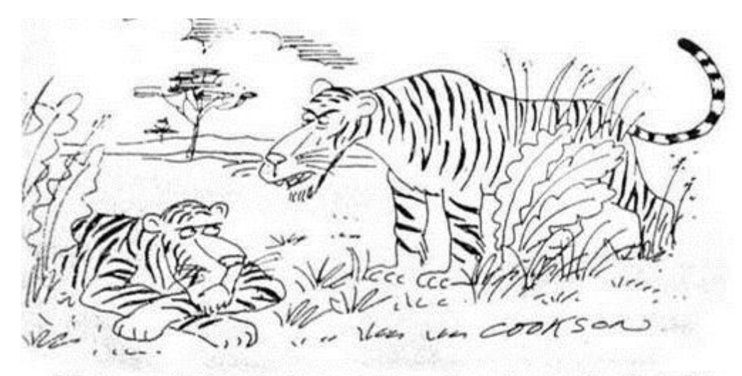
'We're on the brink of extinction and you have a headache?'