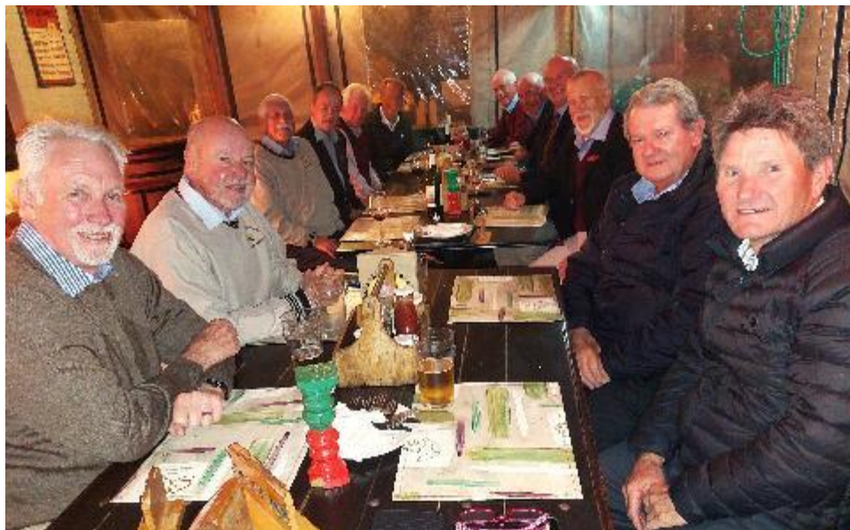
Some of those who attended the supper at The Bierfassl