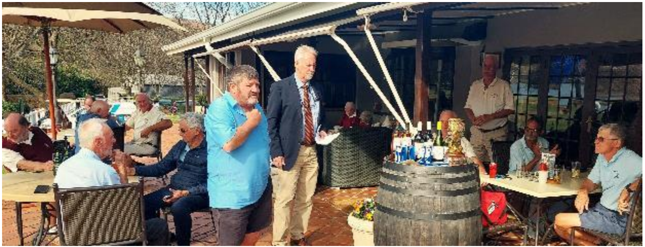
Prize Giving at Bosch Hoek GC