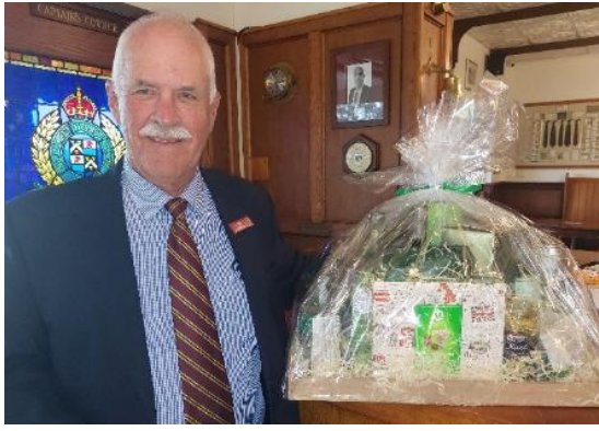
Les Orchard winner of a hamper